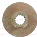
BASE DE FRENO